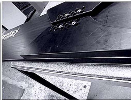
Picture 3: Finished result: the plate lines up with outer edge of the board.